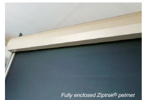
Fully enclosed Ziptrak® pelmet

Discover a simpler way to shade and protect your outdoor way of life.