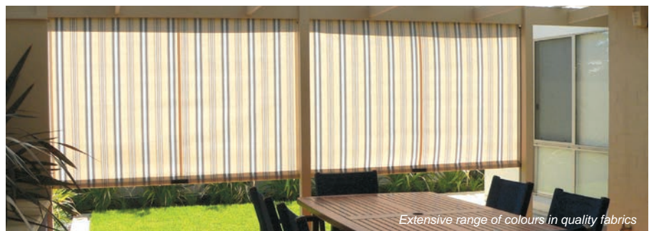
Extensive range of colours in quality fabrics

Discover a simpler way to shade and protect your outdoor way of life.