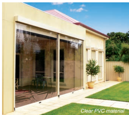
Clear PVC material